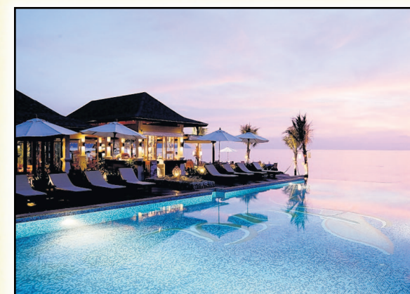
NEW START: La Flora resort was rebuilt after tsunami