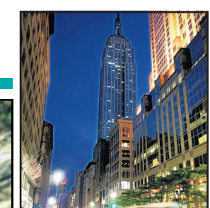
BIG DEAL: For Big Apple

balcony. The sun loungers around the three beautiful pools were all draped with white fluffy towels and the adult-only pool had Jacuzzi areas, a rain shower in the centre and a sophisticated swim-up bar. The restaurants match the decor—trendy and classy. Rebar, an open-air bar with views of the gardens and a perfect place to see the sunsets, has exquisite Thai, Western and Japanese tapas. Indigo Pearl has a wonderfully spacious feel to it, too. Although there are more than 250 rooms, they are spread around the grounds with huge lush landscaped jungle gardens in between. The hotel lies just back from the nearly untouched Nai Yang Beach. It's a quieter and more intimate area than Khao Lak and perfect for couples. Just outside the resort, you can get traditional Thai food in a beach setting. I went to the Octopus restaurant to eat by candlelight. And what a bargain—green curry and rice for less than £3. I also tried a local massage—not in Rattna's class but for £5 for an hour I wasn't complaining. Indigo Pearl offers tennis lessons, a diving centre on site and cookery lessons. I had a private yoga class with friendly instructor Bao who taught me more in 90 minutes than I have learned in two years of practice. Free activities also include Thai boxing, circuit training and language classes—a perfect five-star sanctuary with an affordable price tag. Just like an elephant, it was a holiday I'll never forget!