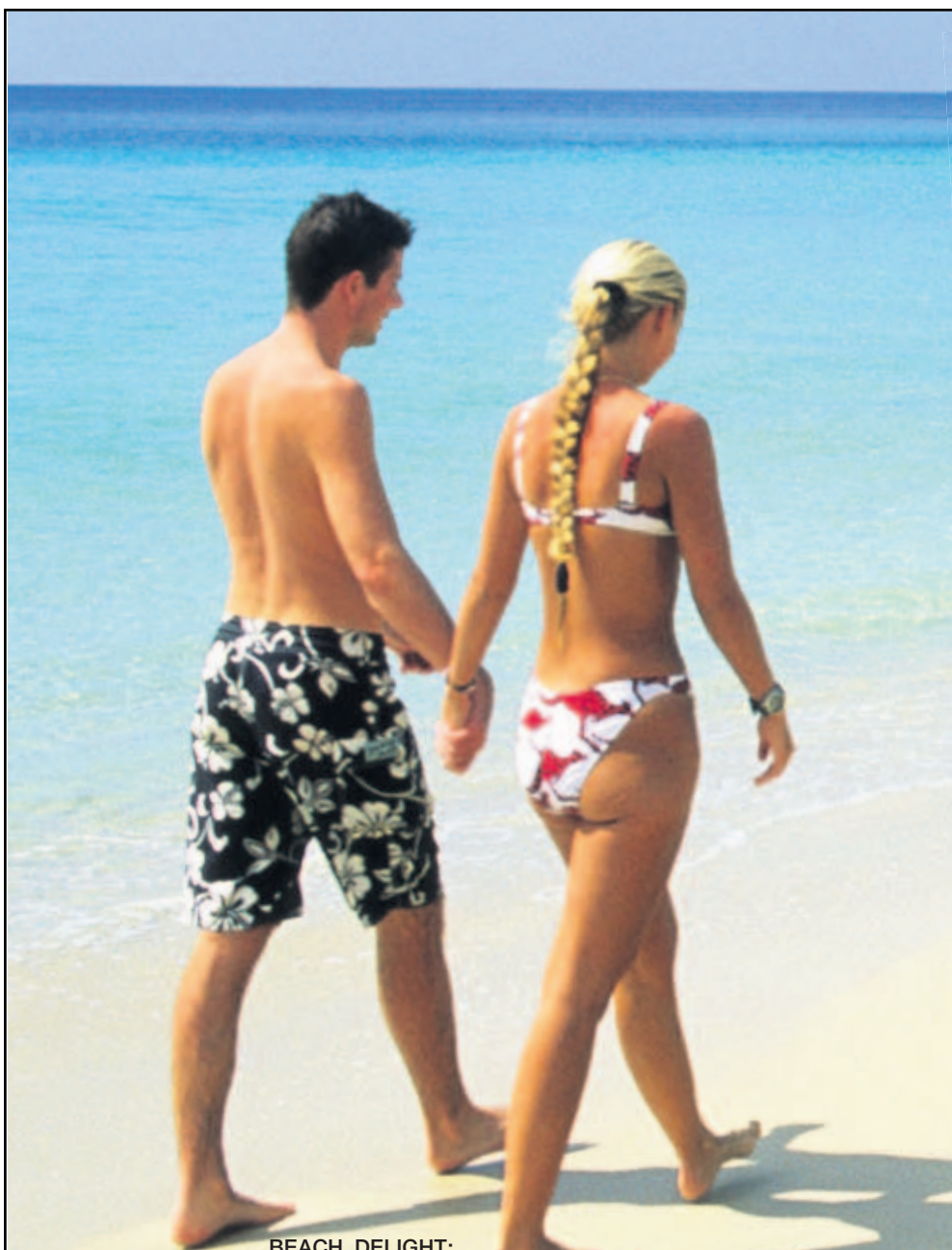
BEACH DELIGHT: Quiet Nai Yang is perfect for couples

GORGEOUS Weekend is a new online service offering luxury holiday experiences in North Yorkshire. Choose a cottage in the Dales, chic apartment in the city or grand Victorian country house by the Moors. Getaways are tailored to your needs—from romantic retreats in a five-star hideaway to luxurious girls' weekends complete with spas and Michelin-star restaurants. Hampers can also be booked for your arrival. More information at www.gorgeousweekend.com