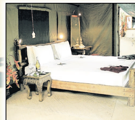
LUXURY CAMP: Comfy tent at Elephant Hills