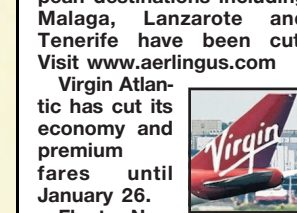
Virgin Atlantic has cut its economy and premium fares until January 26