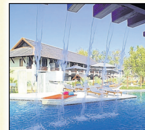
THAI LOVE IT! Pool at Indigo Pearl hotel